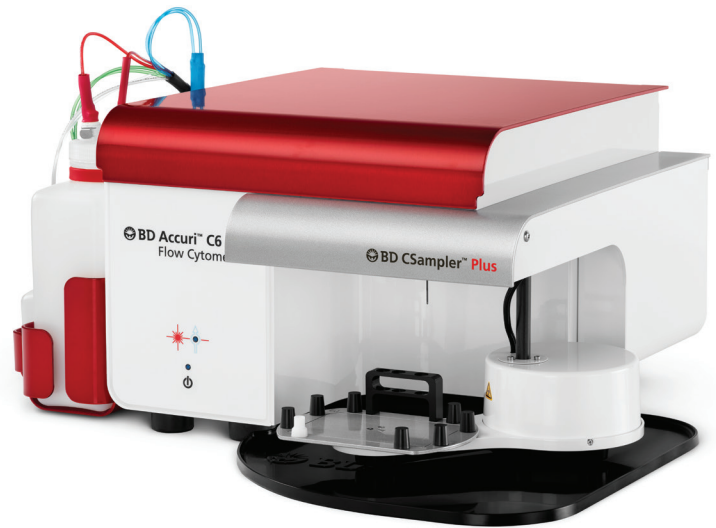
Figure 1. BD CSampler™ Plus automatic sampling accessory